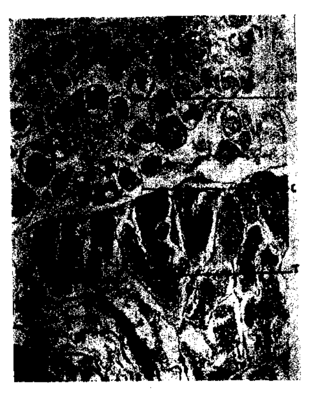
Fig. 2. T. S. of an evotestis of Polynemus heptadactylus (Details of lettering same as above). x 550.

The hermaphrodite nature of the gonads in this species has been verified by studying the micro-sections stained with Delafield's hematoxylin and counterstained with eosin. The photomicrographs (Figs. 1 & 2) of transverse sections of an immature ovotestis show that testis occupies comparatively a very narrow space. A connective tissue layer distinctly separates the two regions of an ovotestis. The lobules in the testis are smaller and in it are lodged a number of specimatocytes whose nuclei are stained deep. The more spreading ovary has larger ovigerous lamellae with a number of oocytes in it.